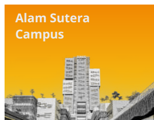
Alam Sutera Campus